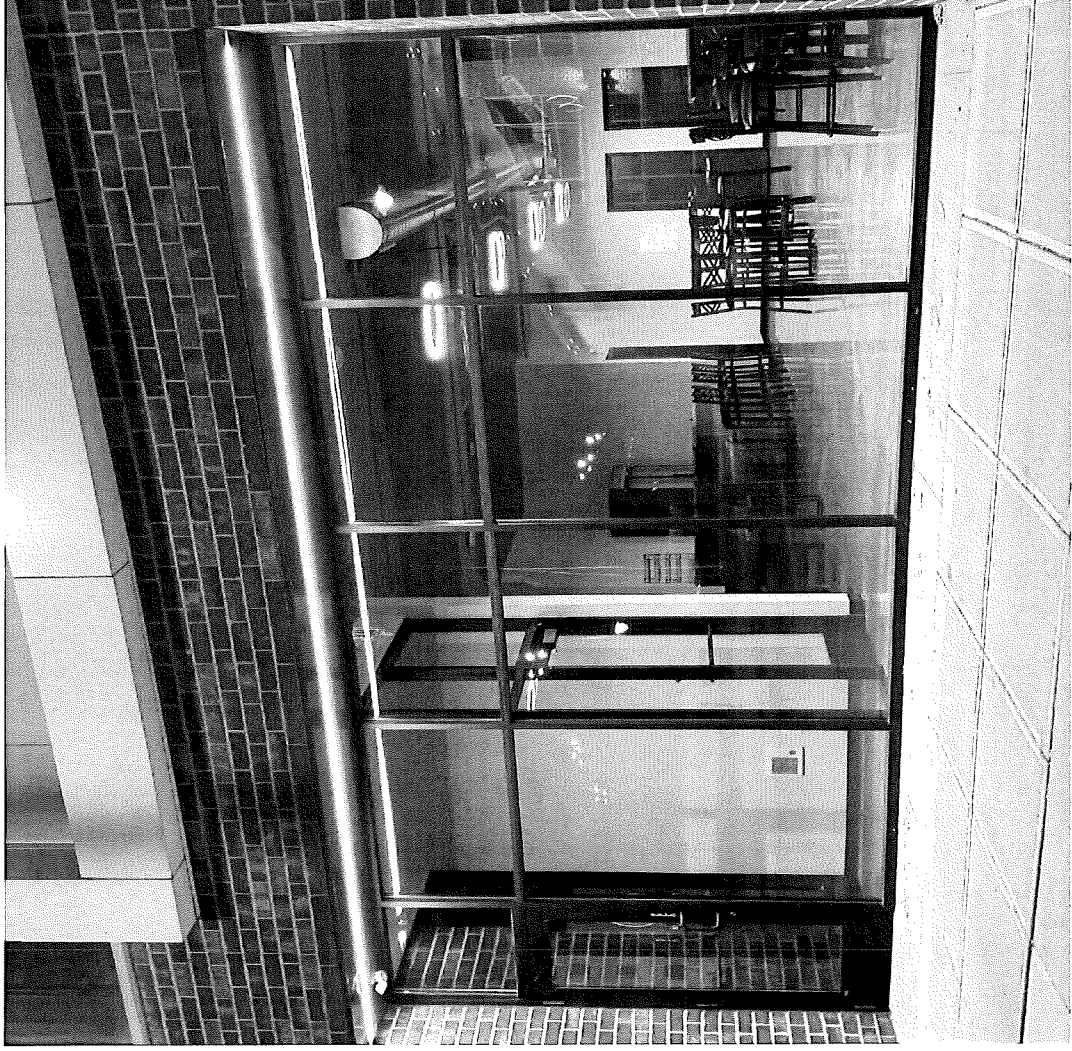
Pictures of the establishment at at 823 W. College Ave taken on 10/16/2024