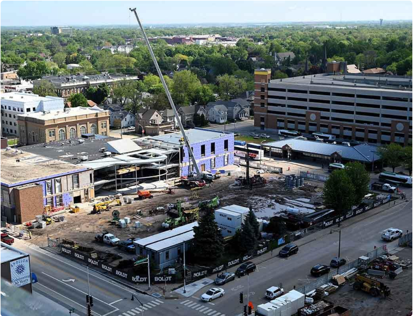
Exterior Southwest View

To learn more about the campaign and how you can participate, visit the Friends website .