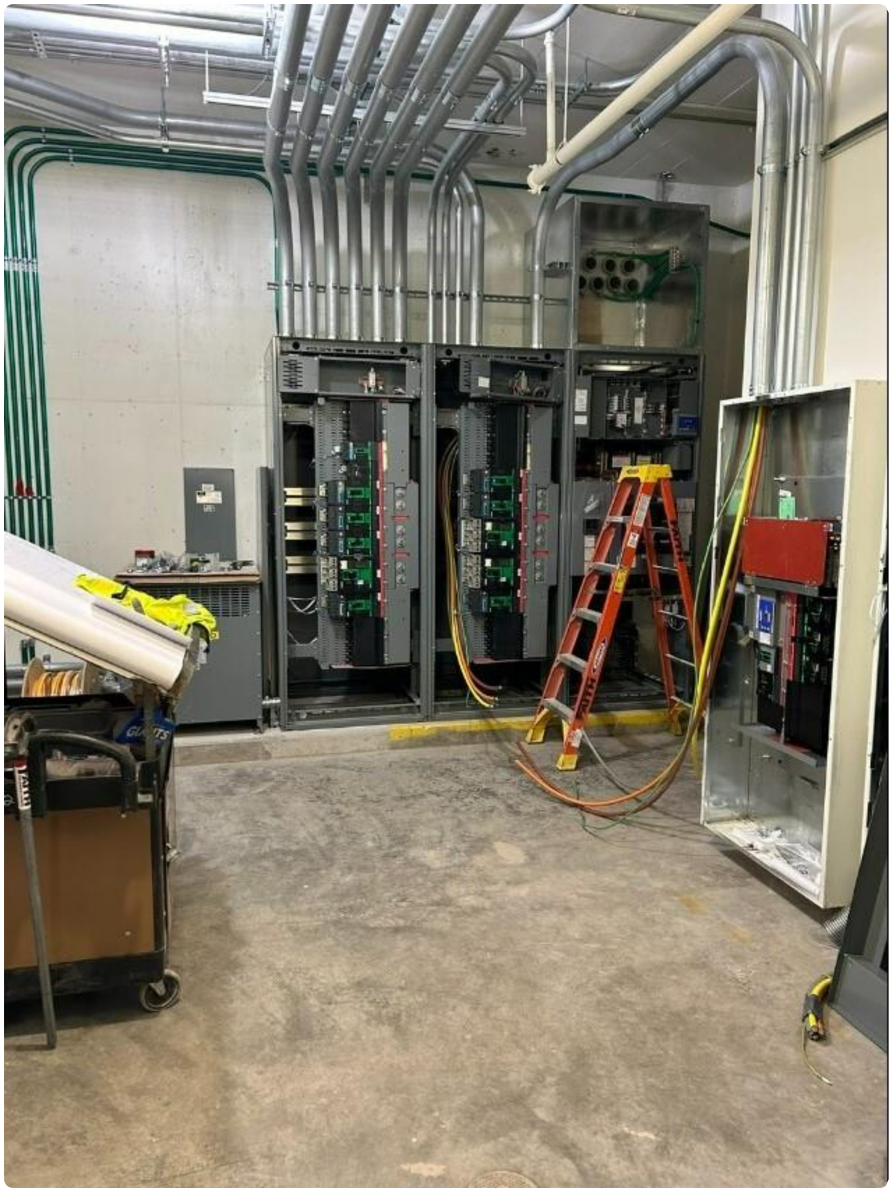
Lower-Level Data and Electrical Room