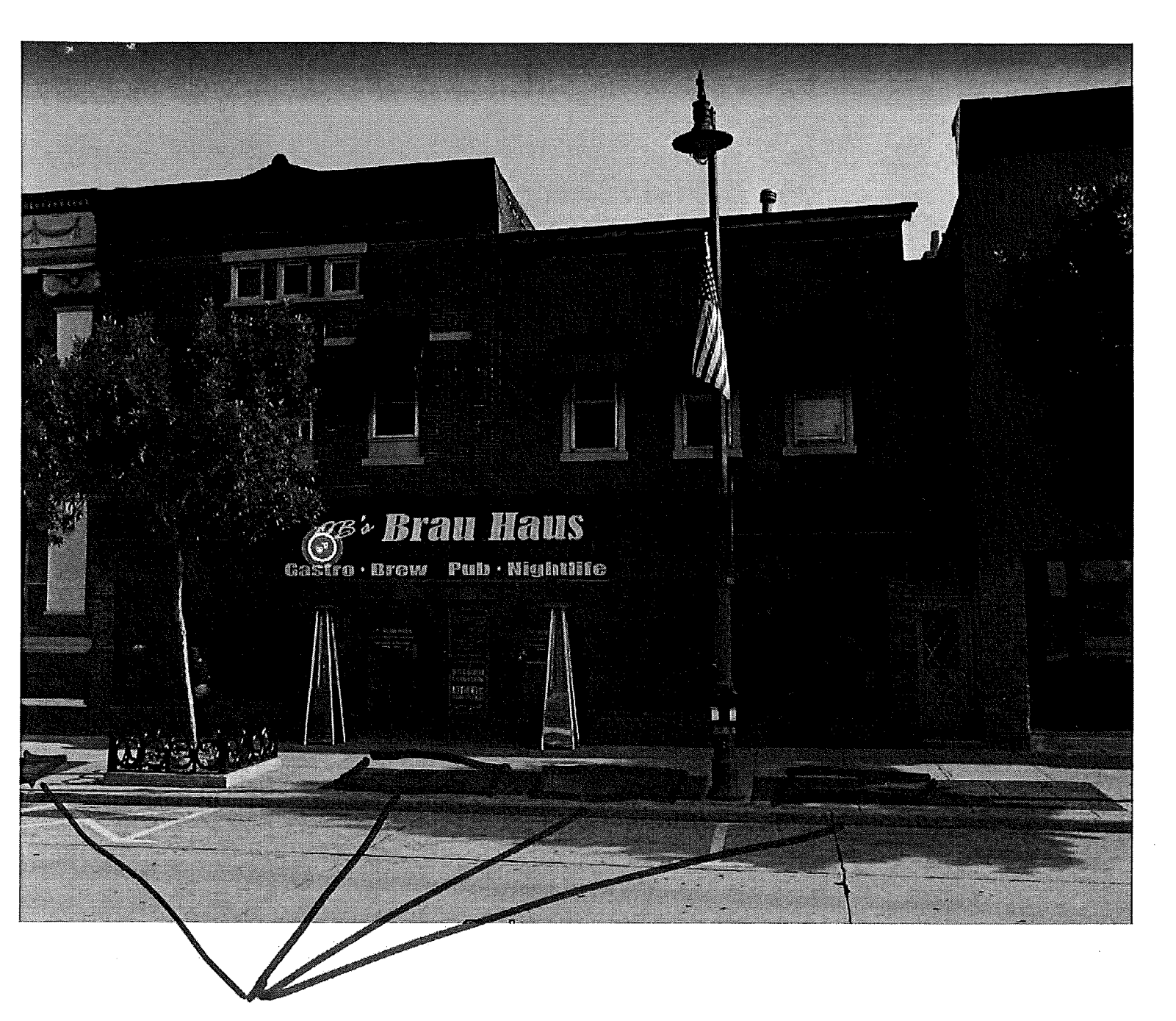
FICHIC TARLES WATTACHED SEATING