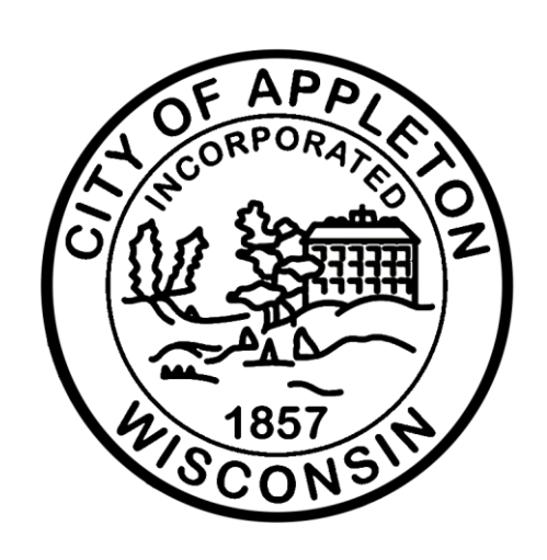
February 14, 2024