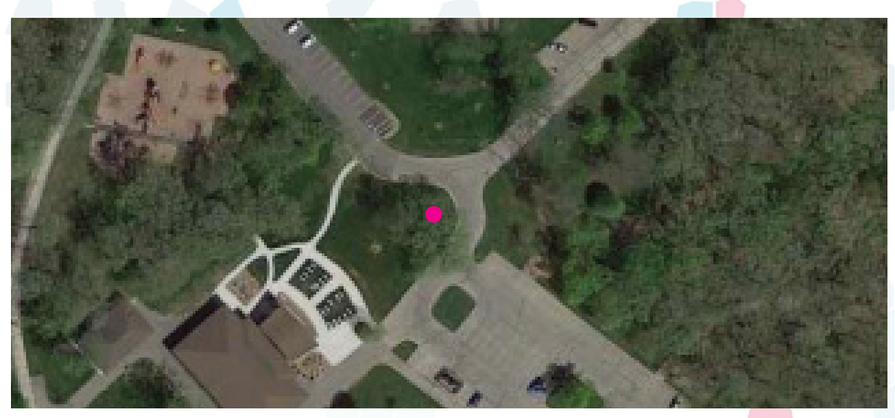
Location of Stairway to the Stars in Pierce Park