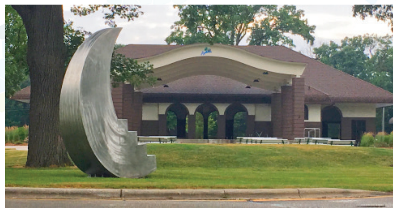
Stairway to the Stars current aspect in Pierce Park