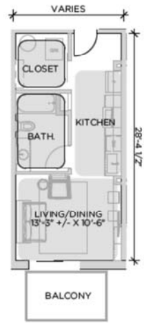
STUDIO TYPICAL PLAN 1/8" = 1' 0"