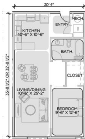
1 BEDROOM TYPICAL PLAN 1/8" = 1' 0"